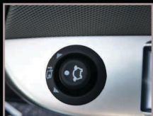
Remote Control Wing Mirror