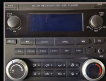
Multi-Function Audio System