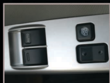
Power Window and Central Lock