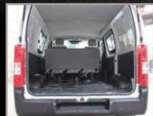
Ample Cargo Space